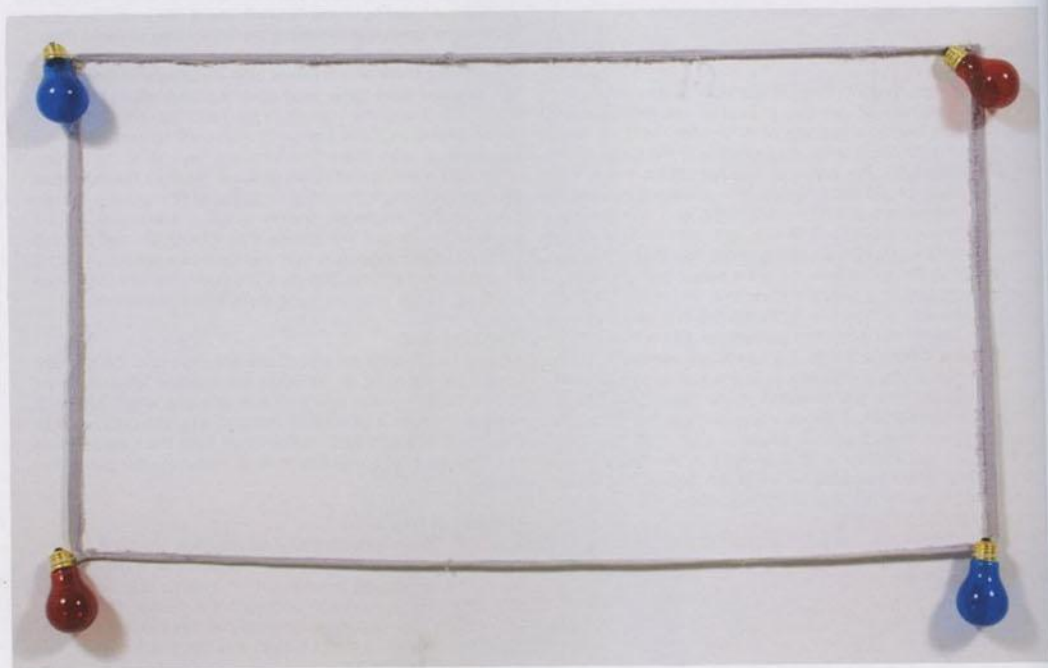
Untitled (single gray negative, red and blue bulbs), 2007 Bath towels, cotton thread, ink and light bulbs 49.2 x 43.7 inches