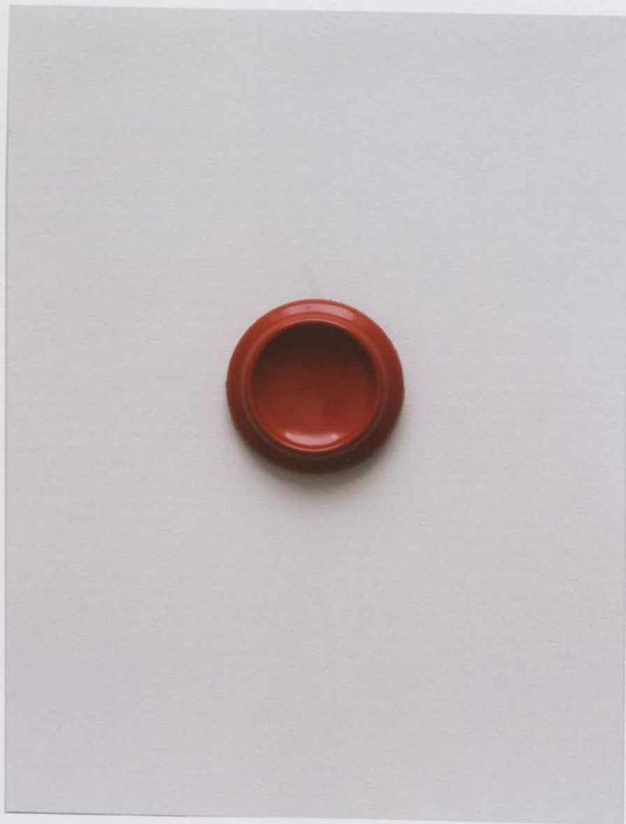
Untitled , 2008 Collage, spray paint and soda can 9 x 12 inches