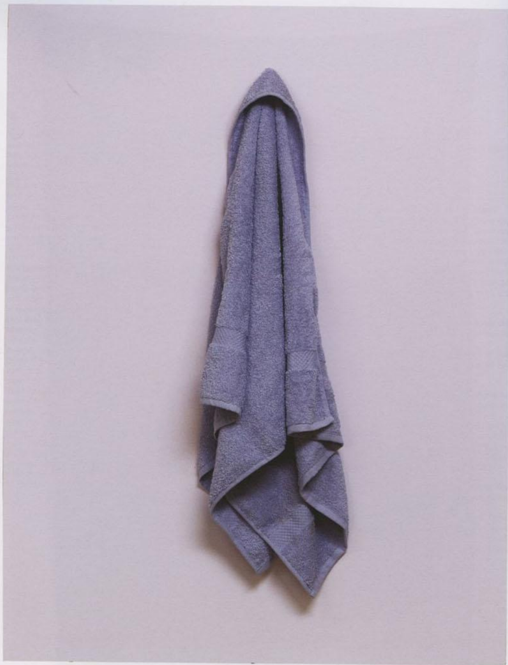
Untitled (towel hook painting), 2008 Bath towel, wood panel, house paint and ink 30 x 40 inches