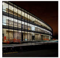
The Office as Architectural Touchstone