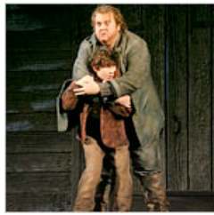
Britten's Tale of the Haunted Misfit