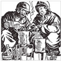
A Life of the Soldier— Cartoonist Bill Mauldin