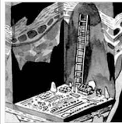
Op-Ed: My Forbidden Fruits (and Vegetables)