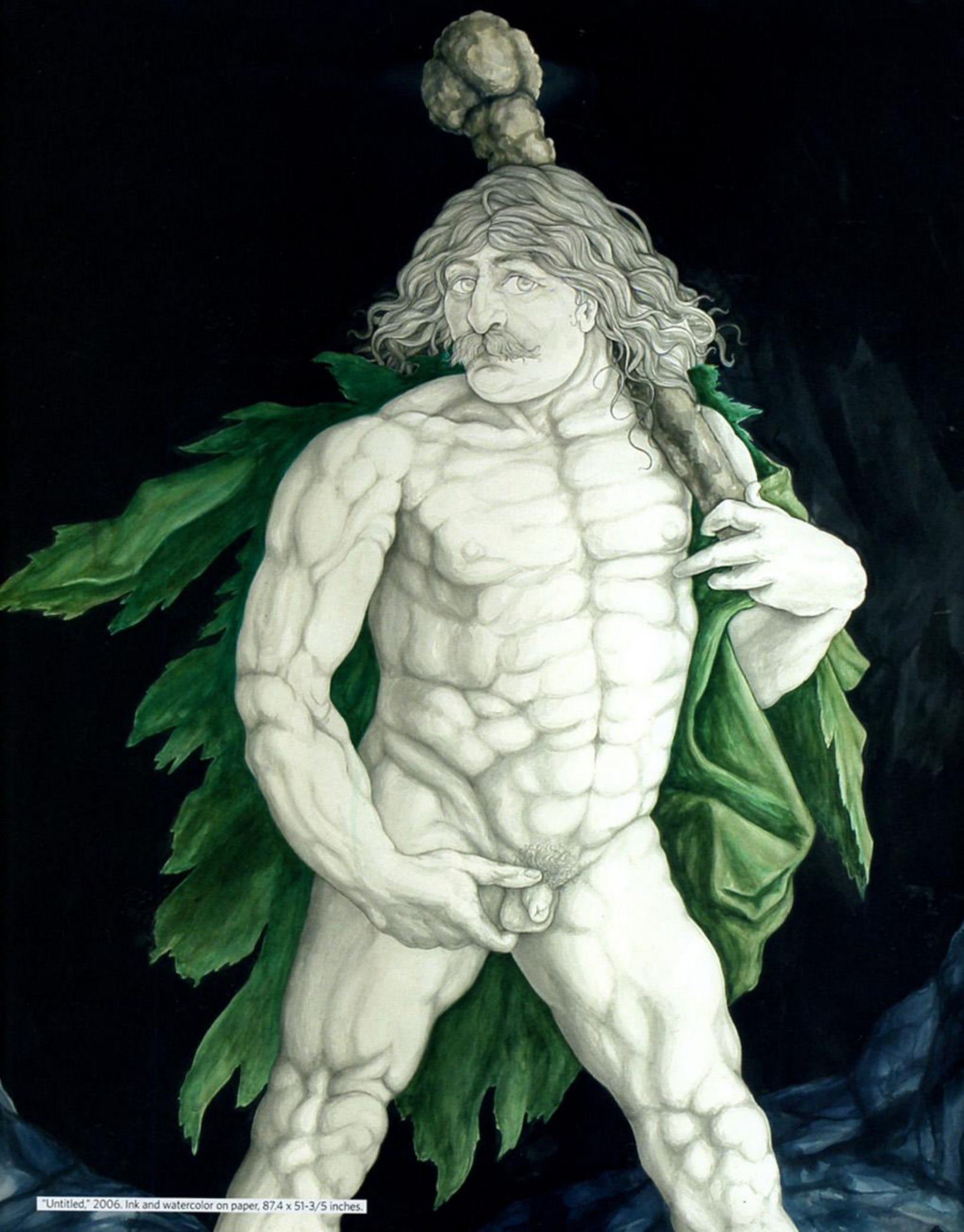
"Untitled," 2006. Ink and watercolor on paper, 87.4 x 51-3/5 inches.