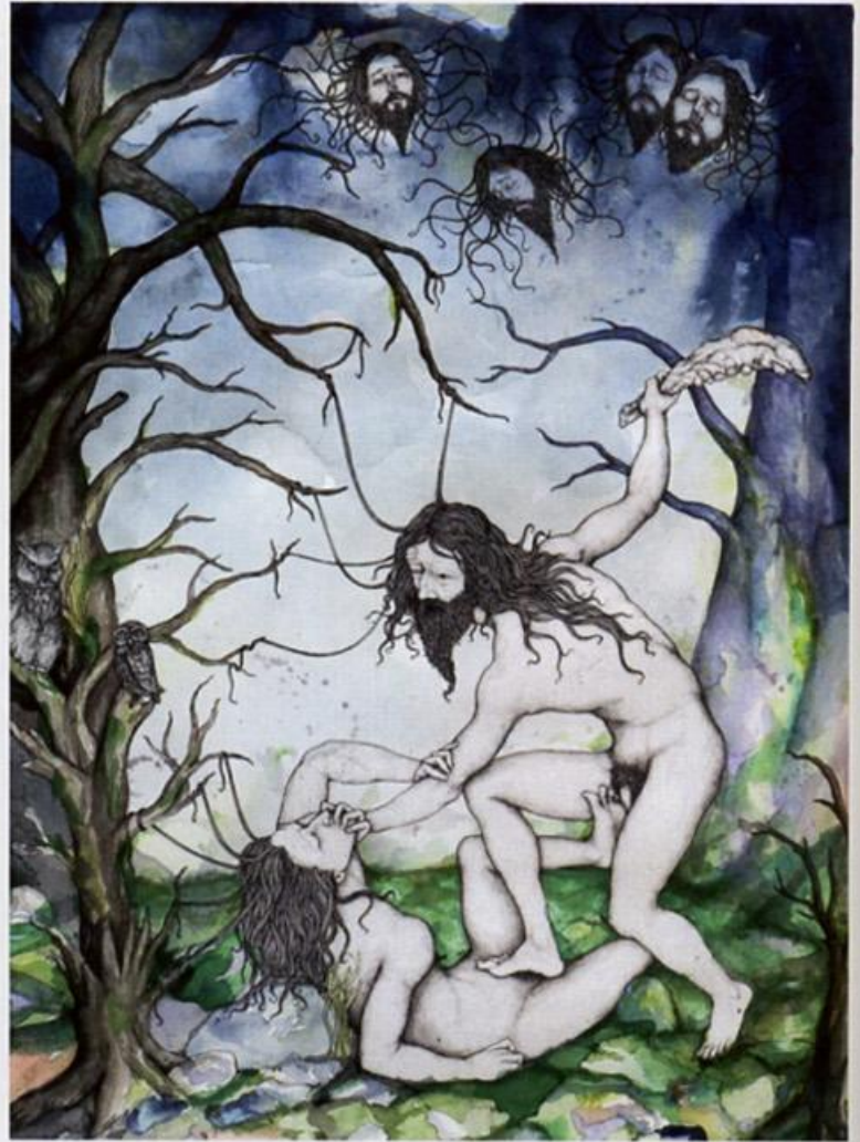
"Untitled," 2007. Watercolor and ink on paper, 14 x 10-1/4 inches. "Untitled," 2007. Watercolor and ink on canvas, 15-1/4 x 11-1/3 inches.