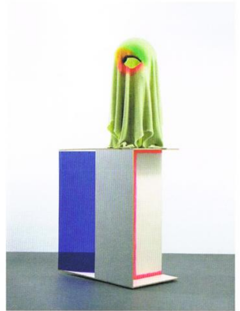
PATRICK TUTTOFUOCO, David Bowies, 2010. Coated MDF, perspex, paint, wool, epoxy, resin, 125 x 61 x 220.