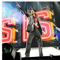
The Pop Spectacular That Almost Was