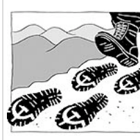
Op-Ed: Soviets' Afghan Defeat

Home | World | U.S. | N.Y. / Region | Business | Technology | Science | Health | Sports | Opinion | Arts | Style | Travel | Jobs | Real Estate | Automobiles | Back to Top Copyright 2009 The New York Times Company | Privacy Policy | Terms of Service | Search | Corrections | RSS | First Look | Help | Contact Us | Work for Us | Site Map