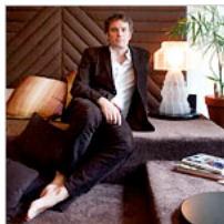
An Ode to '70s-Style Living