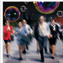
Running From the Bubbles