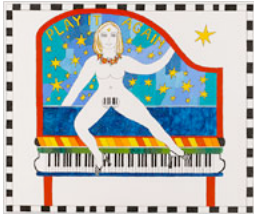
Anton Kern Gallery, New York