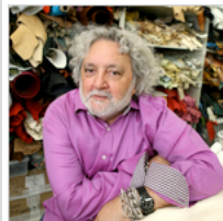
The Return of the King of Patchwork